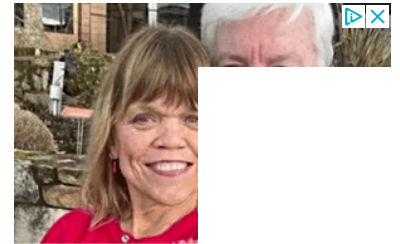
Tori Roloff Sh